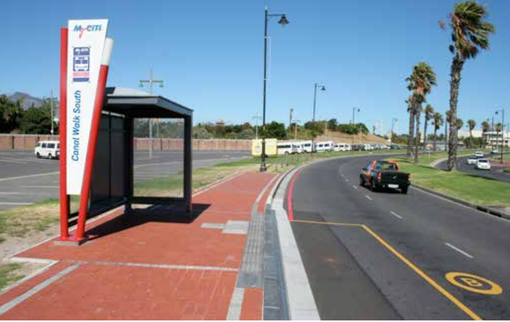
Passengers can catch MyCiTi at stops like this one.

MyCiTi is the City of Cape Town's integrated rapid transit system, which is being rolled out across Cape Town. It is an affordable, safe, reliable scheduled service. You catch the bus at MyCiTi stops and stations. See the map inside for routes and stops.